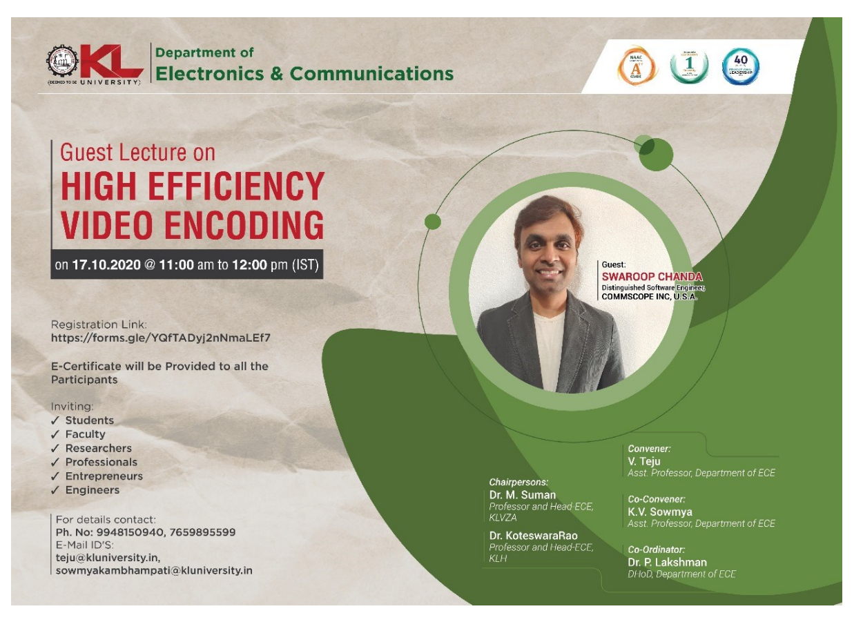
Fig. Poster of webinar